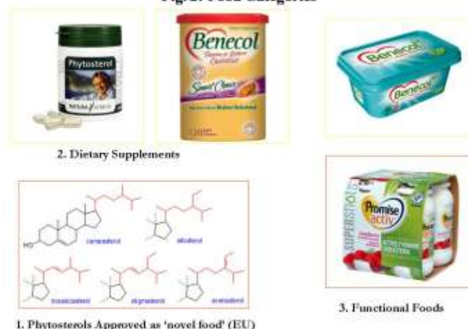
Fig. 2: Food Categories

Dietary or food supplements on the other hand are clearly distinguishable from conventional foods from their distinctive 'discreet dosage' formats of pills, capsules, and powders etc which resemble the 'therapeutic dosage' feature of medicines.