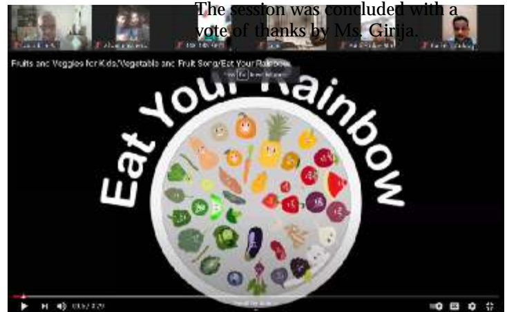
Fruits & Vegetables should be part of daily diet